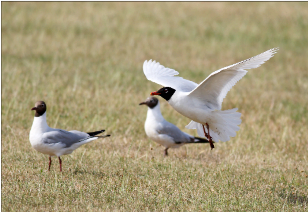
An adult Mediterranean Gull (right-hand bird, with two adult Black-headed Gulls) was a welcome visitor to Wanstead Flats on 6 July.